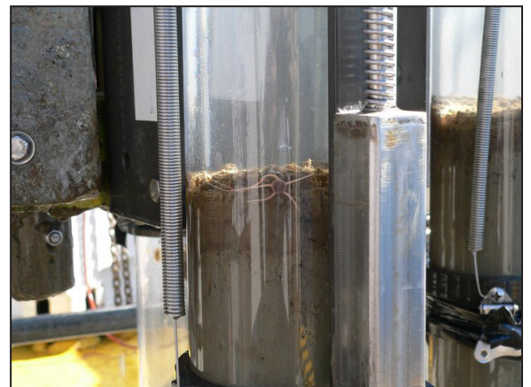
A core tube with a plug of sediment collected from the sea floor, and an unlucky brittle star.

Yeager and Brunner are also closely examining the invertebrate animals that live on the sea floor. These animals are highly susceptible to sediment contamination because they live directly in or on the bottom and because they cannot easily flee. By sampling in oiled and unoiled areas they are able to determine potential impacts of hydrocarbon contamination on the health of the benthic (bottom) ecosystem. Since the spill, researchers have been documenting changes in how many animals of a particular species are present, how many different species are present, and how the animals are dispersed in a given area. So far, while they have seen changes in the composition of the benthic community, no mass die offs were observed in their sample areas.