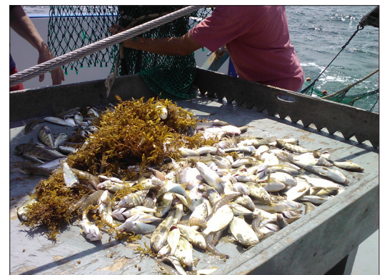
Sample from a trawl net collected in Mobile Bay after the oil spill.

Almost immediately after the failure of the Deepwater Horizon (DwH), scientists at the Dauphin Island Sea Lab began collecting baseline data to assess the make-up and abundances of commercial and recreational fishes in the nearshore waters of Mississippi and Alabama. The nutrient rich estuaries in the northern Gulf of Mexico (NGOM) contain a number of critical habitats including oyster reefs, seagrass beds and saltmarshes. These habitats provide protection and feeding grounds for ecologically and economically