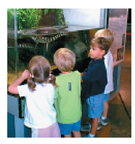
DHP keeps the ocean alive for young students, offering several half-day camps for young children and their parents during the summer.